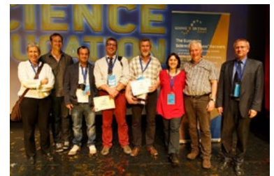
Winning teachers in the ISE Scenario Competition 2014-2015