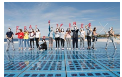
Winning photo of Eratosthenes Sep 2015

Three competitions – all guaranteed to provide the teaching experience of a lifetime